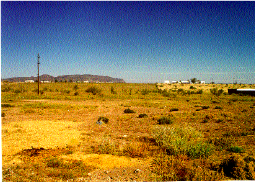
Fig. 4. Rangelands near cities and major highways are much more fragmented and have higher proportions that are in low ecological condition and are overgrazed than those in remote locations. Noxious plant invasion is a serious problem on this fragmented rangeland in southwestern Texas.

ecological condition in 1952 compared to 1999. However, there was considerable change within decades, primarily due to climatic variability.