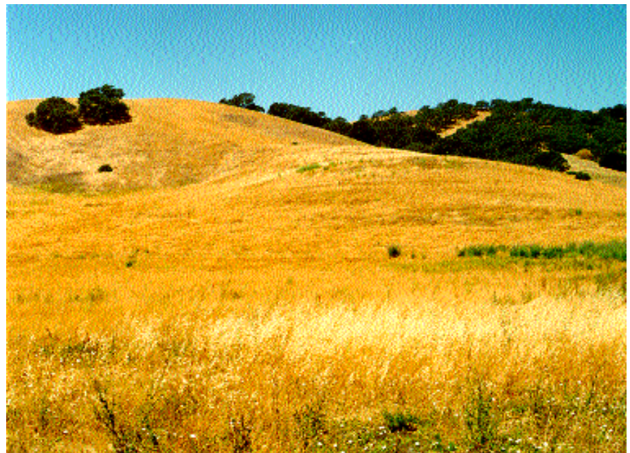
Fig. 5. The author has observed very little overgrazing in various trips through the California annual grasslands. Even near large urban areas such as San Francisco (above photo) annual grassland rangelands are generally quite well managed. The author attributes this to well thought out research-extension programs by the California land grant universities.

Shrinkage in the land base, declining ranching profitability, the anti-grazing