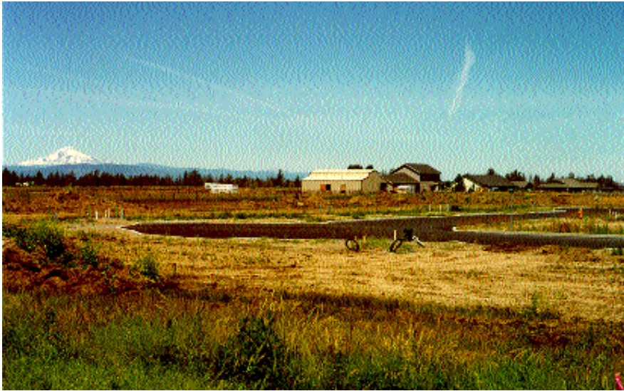
Fig. 1. Conversion of a central Oregon ranch into housing in July 2000. The author observed widespread conversions of rangeland to urban housing and ranchettes on a circular trip through California, Oregon, Nevada, Arizona, and New Mexico in summer 2000.

and other fragmented information, 2-3 million acres of rangeland may now be lost per year in the 11 western states and another million are lost in the Great Plains. Texas, now losing about 250,000 acres per year, has the highest rangeland losses to urbanization. It is the accelerating trend in losses that is most disturbing. Data from USDA-NRCS (1997) indicate total rangeland losses were about 1 million acres per year for the 1982-1992 period. However losses may be 3-4 million acres presently (Figure 1). Western states with the most rapid rates of rangeland loss are Texas, Arizona, Colorado, and California.