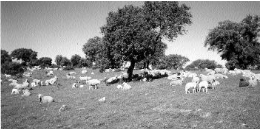
Fig. 1. Typical dehesa in Cuatro Lugares .

The "crisis of the dehesa " in the 1950s and 60s led to a process of modernization. Farmers shifted to new products, e. g. lamb meat instead of wool or cattle instead of sheep. Production cycles in stockbreeding were accelerated by the cross-breeding of more productive breeds with the indigenous breeds or their complete replacement. Stocking densities were increased. The result was a need for increased external feeding and a higher susceptibility to diseases. Consequently, inputs of energy and nutrients like concentrate fodder, fertilizers, biocides, and veterinary products into the dehesas have increased.