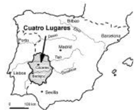
Fig. 2. Location of the study area in the Extremadura region in Spain.

—use of hardy, indigenous breeds of livestock that are well adapted to