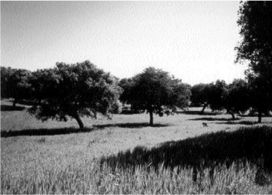
Fig. 3. Extensive fodder cultivation in the dehesas.